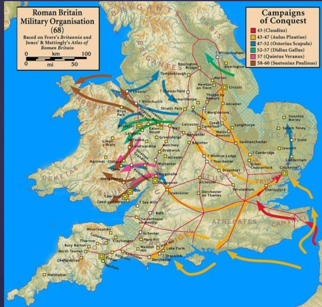
Campaigns under Claudius in AD 43