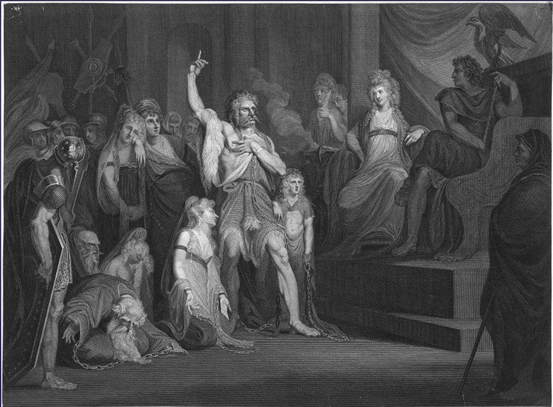
CARATACES AT THE TRIBUNAL OF CLAUDIUS AT ROME.