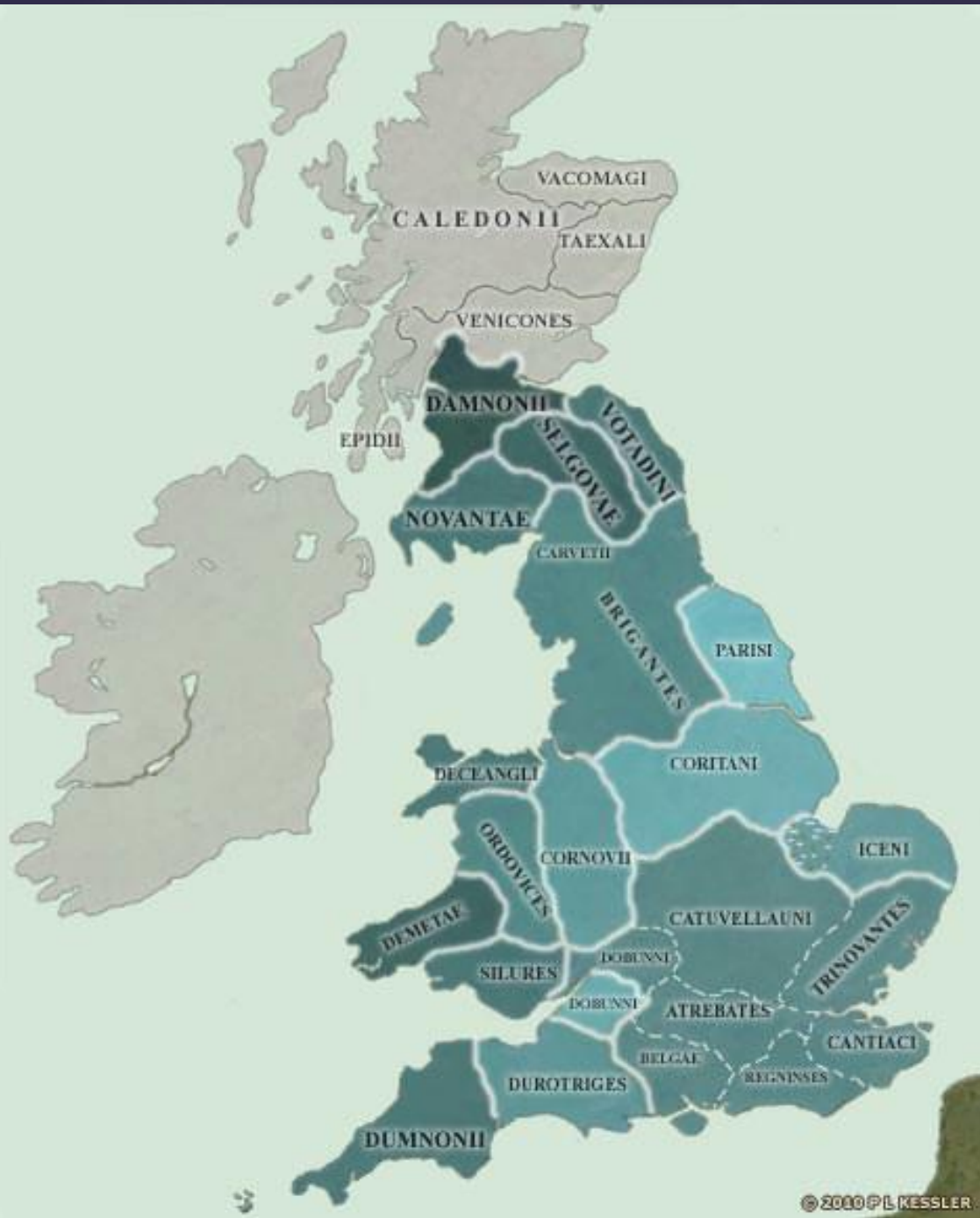
Map of the British Isles in AD 43