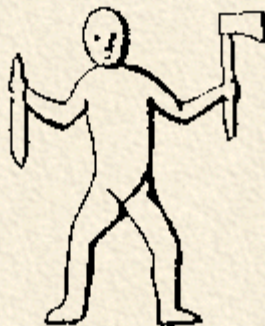
Left: Thor from the Møgeltønden Horn