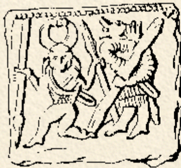
Right: 7 th century Plaque showing Beowulf and Grendel from Torslunde, Sweden